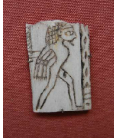
British Museum ( London )