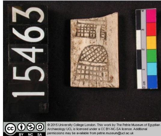
Petrie Museum ( University College London )