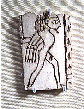
Renée Friedman, personal communication, 2018