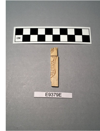
University of Pennsylvania Museum of Archaeology and Anthropology ( Philadelphia )