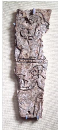
Renée Friedman, personal communication, 2018