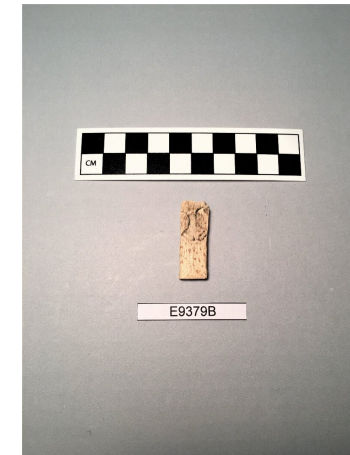
University of Pennsylvania Museum of Archaeology and Anthropology ( Philadelphia ) E9379B