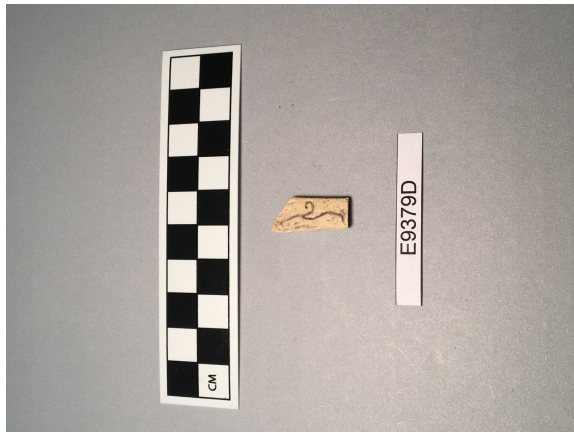
University of Pennsylvania Museum of Archaeology and Anthropology ( Philadelphia ) E9379D