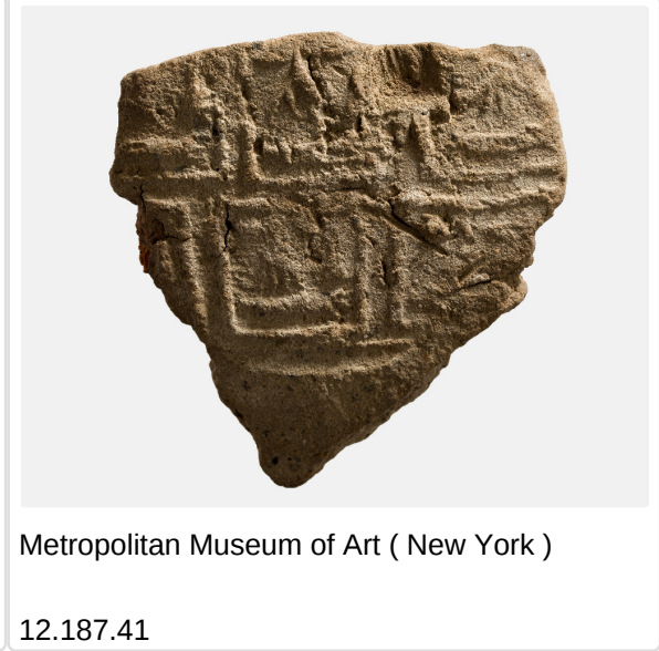
Metropolitan Museum of Art ( New York )