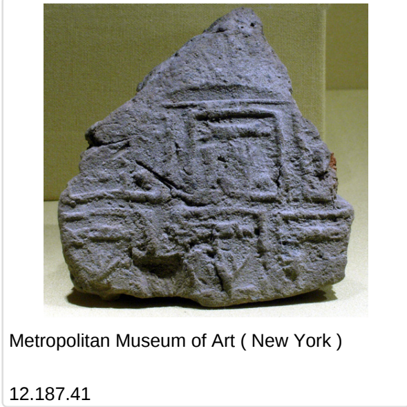
Metropolitan Museum of Art ( New York )