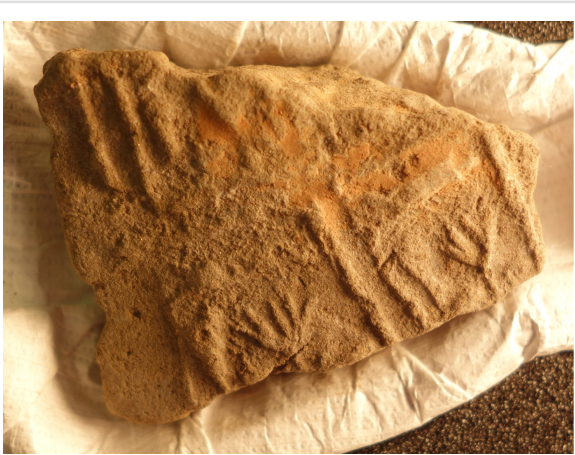
Fitzwilliam Museum ( Cambridge )