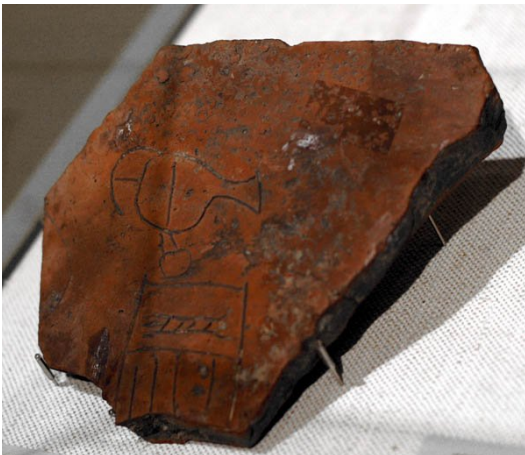
Museum of Fine Arts ( Boston )