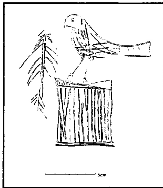
Figure 10. Gebel Tjauti. Name of a royal domain incorporating the serekh of Narmer