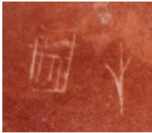
G.J. Tassie, personal communication, 2016