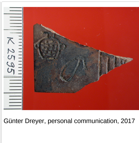
Günter Dreyer, personal communication, 2017